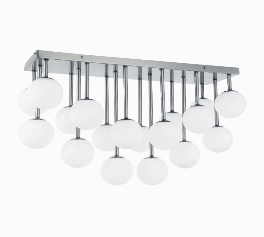
18 Light Halogen Flush Mount, Polished Chrome with White Opal Glass